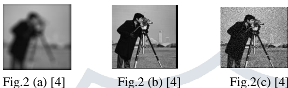
Fig.2 (a) Original image Fig.2 (b) ESSIM= 0.2510 Fig.2 (c) ESSIM= 0.1340

2. ESSIM: The Structural Similarity index(SSIM) is proposed, by hypothesis that human nature is that it will extract structural information from a scene or from any image which he has seen. Also simulation results have proved that human visual system structural features are better than PSNR (or MSE). By deeply studying on the SSIM, people searched that it fails in measuring for the badly blurred images. So, based on this, a researcher has developed an improved method which is called Edge-based Structural Similarity (ESSIM).The newer and improvised version of SSIM is E-SSIM. Edge-based structural similarity (ESSIM), can be defined as the comparing quantity metrics which compares the edge information between the distorted image block and the original one, and replace the structure comparison by the edge-based structure comparison. There are a many ways to get the edge information one of them is the the simple edge detection algorithm and second is the local gradients.