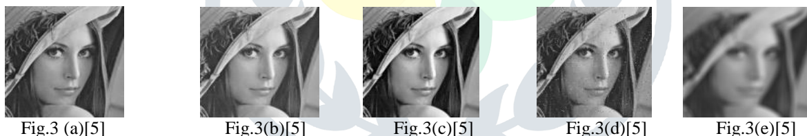
In the above shown Figure 3 (a) to (e) MS-SSIM is decreasing order and MSE in the (a) is 1 while (b) to (e) 225s

3. MS-SSIM: The more flexible method than the other single scale methods is multi scale structural similarity measure. The active SSIM algorithm is a single scale method. This multi scale method image details with different resolutions can be included. Low-pass filtering and down sampling are the two main operations used in this multi scale structure similarity method. The original and the distorted or noisy images are iteratively low-pass filtered and then down sampling will be done on that by factor of 2. For this multi scale operation, the original image is taken as scale1. The highest scale is for example scale M so a total of M-1 iterations are taken place. In the SSIM method, three comparisons have been done i.e., contrast comparison, luminance comparison and the structure comparison, similar to that multi scale structure similarity also has three comparisons. The one comparison is performed on scale M is luminance comparison. Other two comparisons are performed on the intermediate scale and after all these the final quality measurement metrics is the combination of these three comparisons.so one can say that this is a more convenient image quality metric than the other single scale methods.