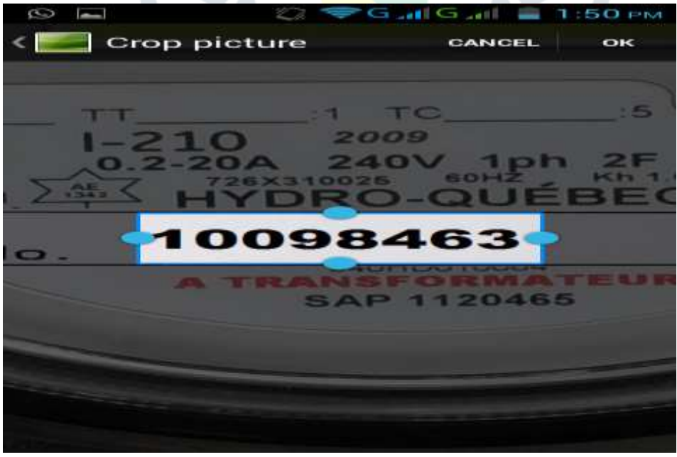
Figure.2 Meter number reading using blue box

As shown in fig.2 user will first capture the image of meter box. Application will show one blue color box which be drag anywhere on the image. User will drag this box on two places first one is meter number and second one is meter reading. After this information will be send to server.