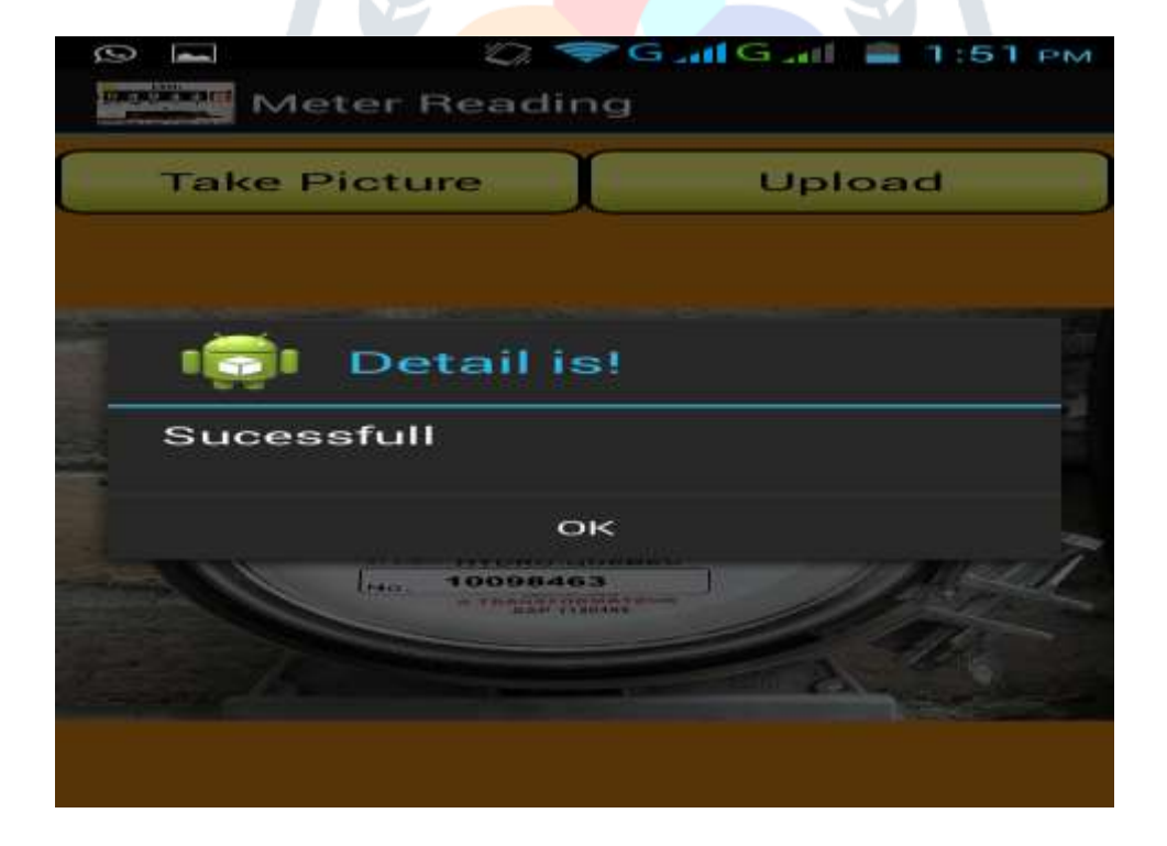
Figure.4.Final Image Submission Screen

The above fig shows the mechanism of taking image. When user wants to take picture of meter he/she will click on the take picture. After this user can upload this image on server by clicking upload button, as shown in figure.4.