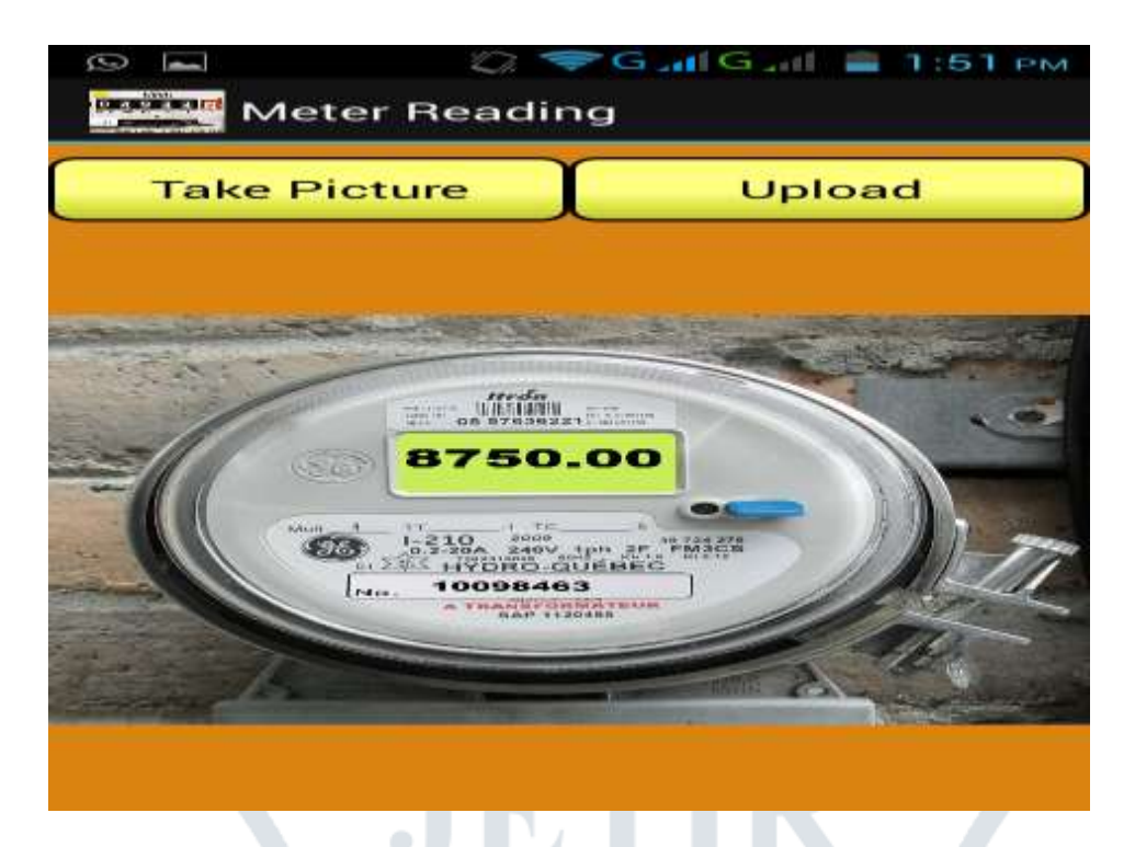
Figure.3. Image taken by device under application

The above fig shows the mechanism of taking image. When user wants to take picture of meter he/she will click on the take picture. After this user can upload this image on server by clicking upload button, as shown in figure.4.