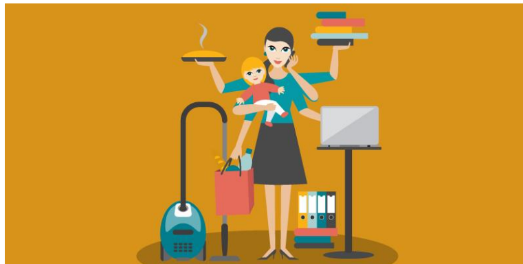
Image 1.1 Different Challenges Faced by Women Entrepreneur.

There are a so many Challenges Faced by Women Entrepreneur. among which 4 are studied and explained below: