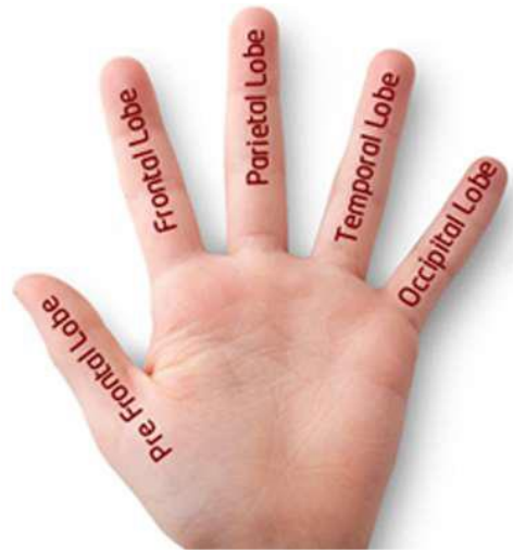
Figure: 2 Relations between Brain Lobes and Fingers.

between specific brain regions and fingers on both hands. The functional coordination overseen by the left cerebral hemisphere corresponds to the fingers of the right hand and vice versa.