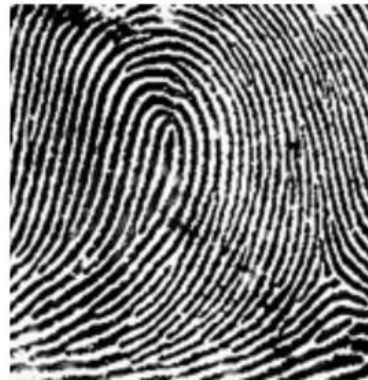
Figure: 4 Loop Patterns.

Loops are the predominant features in an individual's fingerprint, commonly found in various fingerprint samples.