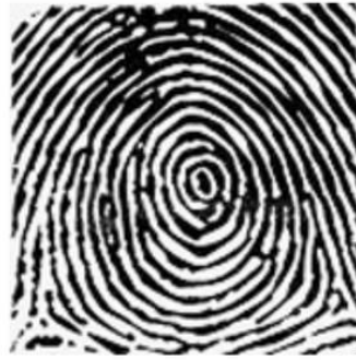
Figure: 5 Whorl Patterns.

Whorl patterns in fingerprints serve as intriguing indicators of character intensity and cognitive prowess, with research suggesting a correlation between the number of whorls and individual skill strength.