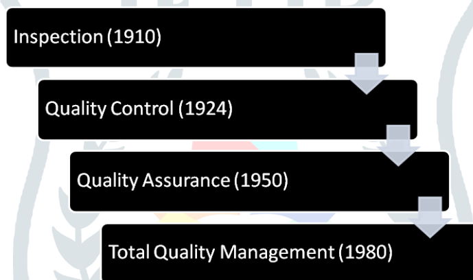
Figure 1.1 (a) - Evolution of TQM

TQM is the fourth and the last step of quality initiative till date as shown in figure 1.1 (a) and 1.1 (b). The term of TQM was firstly used by the defence authorities in the United States (Evans & Lindsay, 2001). At that time TQM considered as the new term given to Total Quality Control (TQC) and it is considered that quality is not to control but it is to manage (Kanji & Barker, 1990). Firstly Japanese started their special work towards quality in 1962 and invented a concept of quality circle. USA also makes progress towards quality management but with less force than the Japanese. In the early 1980s American realized that they are lagging behind as compare to the Japanese in producing the quality products. At that time American take this as a crucial factor for their organizations accomplishment and take it as a management strategic in product as well as in service sector to satisfy the needs of the customers. Today, it is well known structured approach used by most leading organizations to develop their quality improvement programmes.