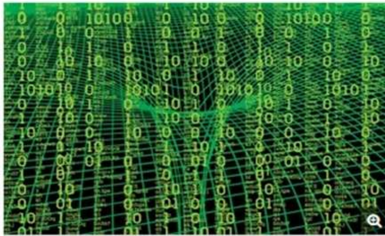
Figure 2: with Quantum encryption, in which a message gets encoded in bits represented by particles in different states, a secret message can remain secure even if the system is compromised by a malicious hacker.

Quantum cryptography could give unbreakable security within the near future, perhaps in the accompanying couple of years, investigators fight. The improvement depends upon quantum mechanics, the laws of nature that control the lead of unassuming subatomic particles, to guarantee that rubbernecks can't snoop on secure messages without being seen. These structures can pass on splendidly a secured correspondences and unbreakable codes, notwithstanding when the gadgets making the quantum cryptography are to some degree unstable or have been hacked by a pernicious outcast.