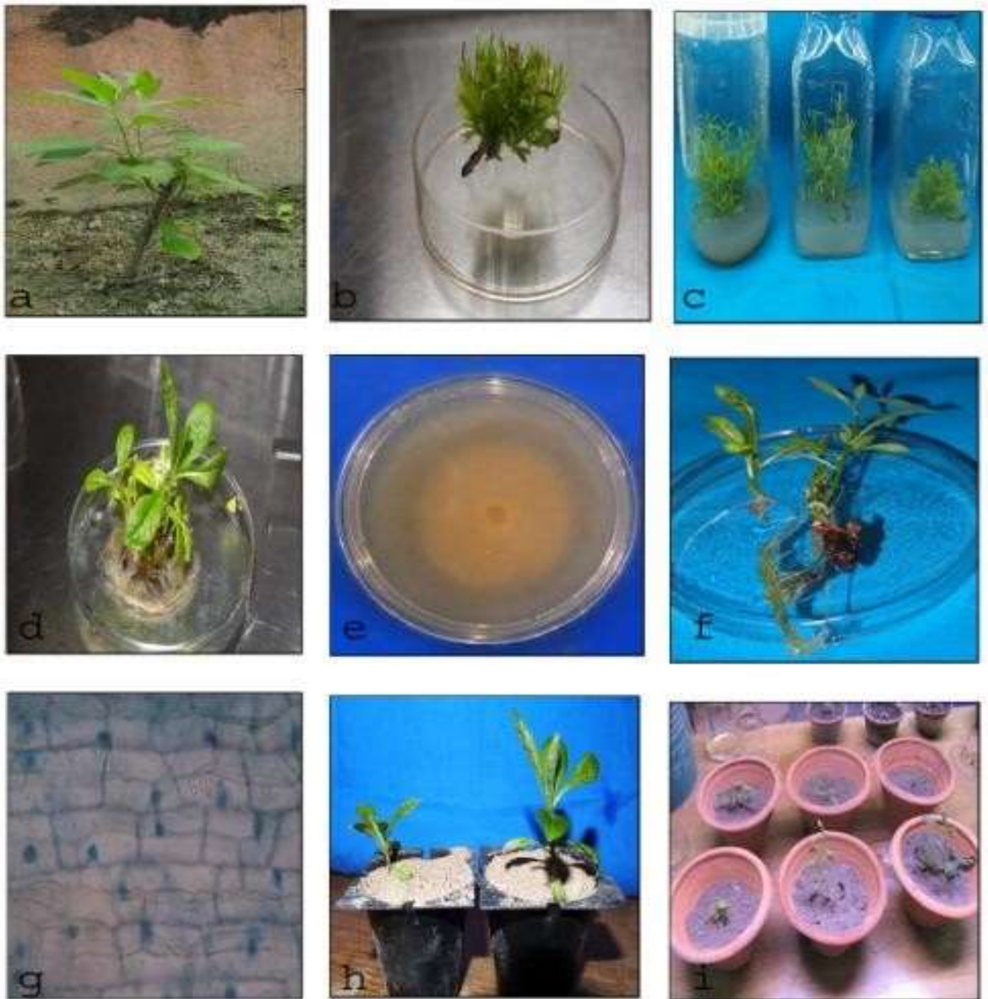
Fig.1: Biotization of micropropagated Vernonia divergens plant