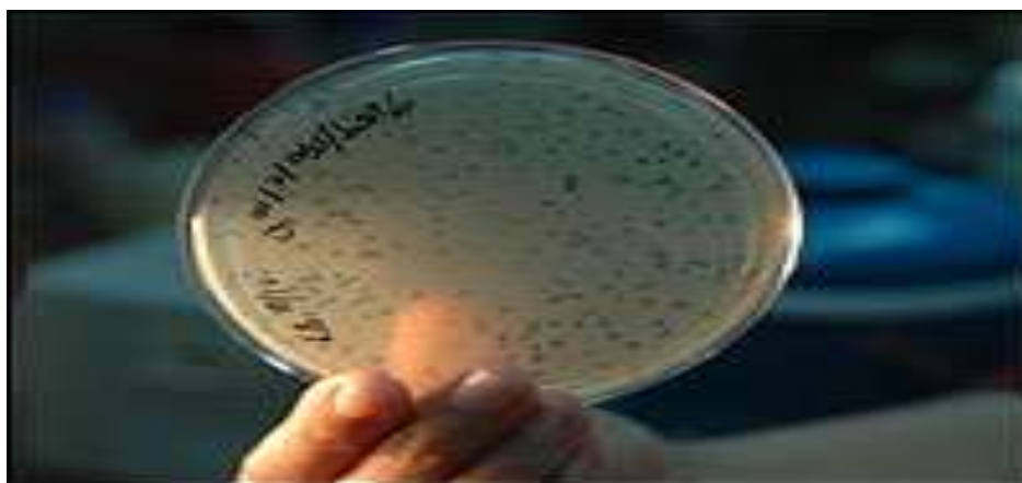
Clear spots on the petri dish mark where phages have destroyed bacteria in a sample of water taken from the Ganges River. [5]

significant number of founding studies on Ganges were carried out mainly by British and French microbiologists. Such studies on Ganges led to the introduction of bacteriophages to the world. Bacteriophages are the prokaryotic viruses that solely infect and/or destroy the bacteria. Bacteriophages were associated with the special property of river Ganges [6,7].