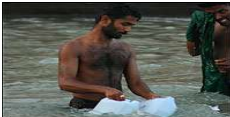
A man gathers water from the Ganges River at Har-ki-pairi ghat in Haridwar.

In 1927, Flix dHerelle, a French microbiologist, was amazed when he saw that only a few feet below the bodies of persons floating in the Ganga who had died of dysentery and cholera, where one would expect millions of germs, there were no germs at all! In other words, Hindus had for thousands of years rightly believed that Ganga purifies the dead bodies, which is why probably the bodies of even those who died of infectious diseases were offered to this river for purification![4] In other words, the water of river Ganga can be an alternative for using antibiotics to treat bacterial diseases! Ancient Indians who used the water of rivers like Ganga never required any antibiotics, for the very water they used was anti-bacterial in nature! This type of Bacteriophage Therapy has been suggested by many researchers, but rarely tried/tested or practised in the health industry. In fact it was in the former Soviet Union that the most active research about using bacteriophages to treat bacterial diseases was done at the George Eliava Institute! This research institute was co-founded by George Eliava and Felix DHerelle after DHerelle introduced Eliava to the wonderful world of Bacteriophages.