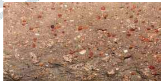
Fig 1.1 Color change in the concrete due to elevated temperature

Due to fire discoloration takes place and the possible change in concrete is normal, pink, whitish grey and puff.