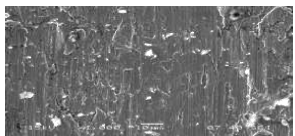
150° C normally cooled 10 microns(magnified picture)