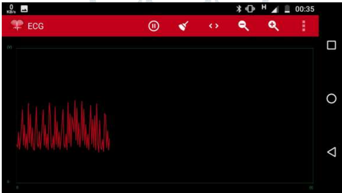
Figure 2: Normal ECG