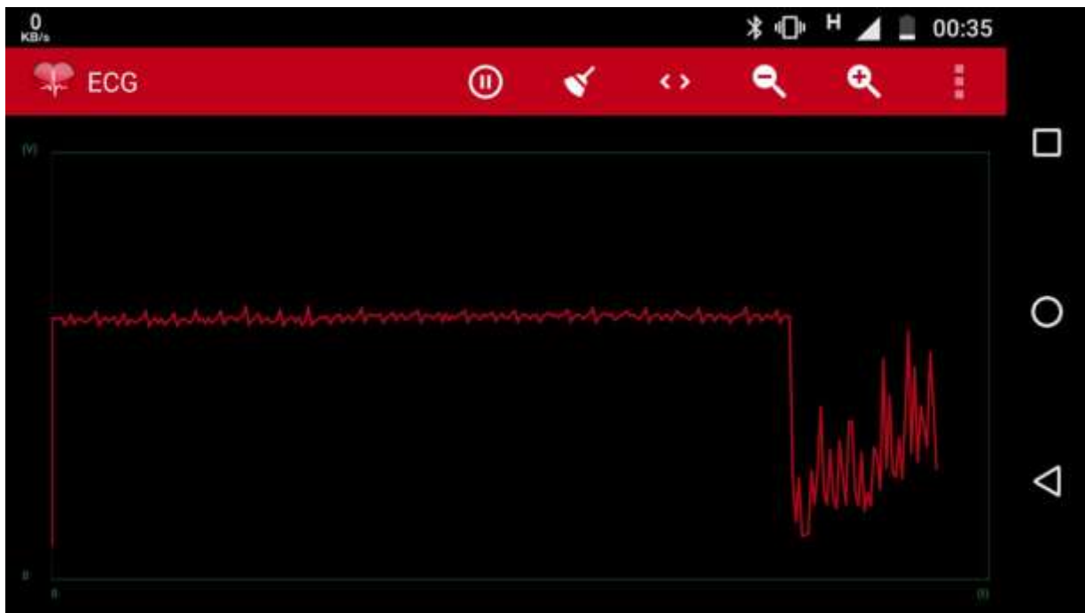
Figure3: Sinus Bradycardia

Smartphones detect, analyse and control the current drivers the pacing of heart and also monitor it at each instance. That is Smartphones acts as Transcutaneous pacers of the heart.