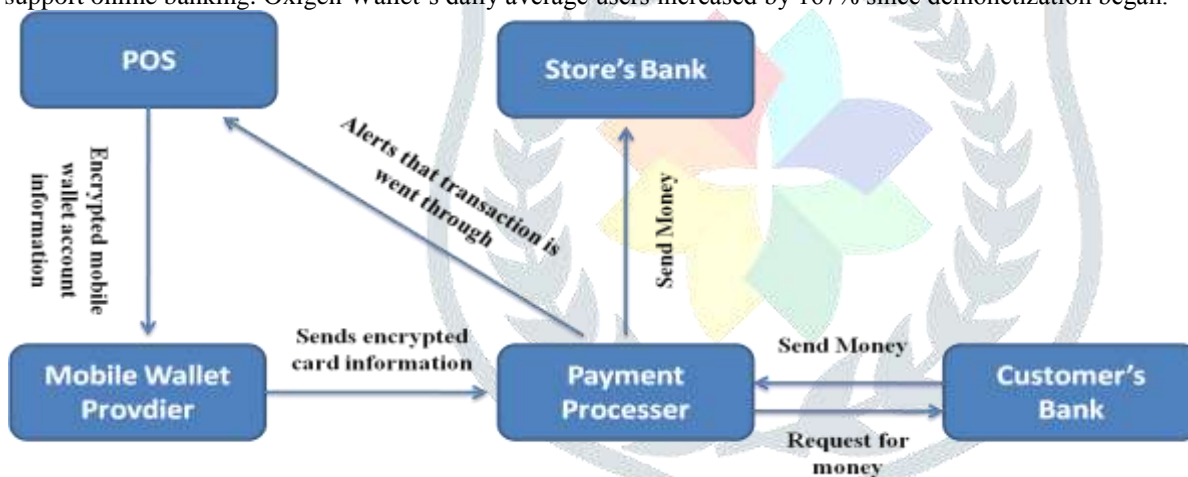
Fig. 4.3: Working of Mobile Wallet Components

Oxigen Wallet is one of the semi closed wallet that is approved by the RBI. Using Oxigen Wallet one can transfer money to your friend’s bank account and other bank accounts also simply using your Smartphone. This feature can be extremely useful if your bank does not support online banking. Oxigen Wallet’s daily average users increased by 167% since demonetization began.