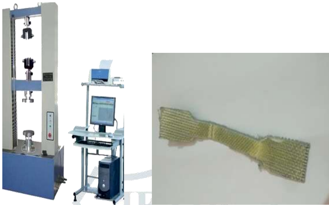
Figure No.-1 (a) UTM machine (b) tensile test of the specimen