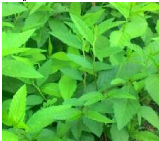
Fig. 1. Habit of Sida acuta

Kingdom : Plantae Division : Angiosperms Class : Dicotyledonay Order : Malvales Family : Malvaceae Genus : Sida