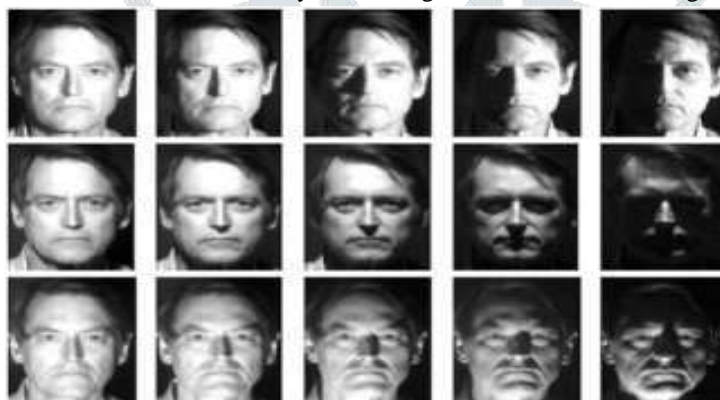
Figure 3.5 Illumination Variation

It is the most crucial factor in deciding the quality of an image and also decides the evaluation time to detect a face. A bright image impedes the detection of certain set of features of the face. Similarly, a dark image produces low contrast image making it difficult to detect the variation in the intensity level along the face as shown in Figure 3.5.