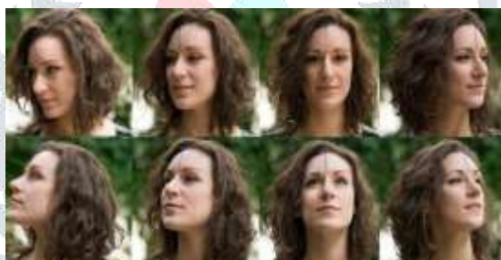
Figure 3.1 Head Rotated in Horizontal Direction

As the human head is somewhat like a sphere in 3D space, it is difficult to get the image of the face facing towards the viewer and at the center position all time as shown in Figure 3.1 Due to this, sometimes an eye, partial nose would be blocked. Hence the face may appear in half profile and would make it difficult to extract the features that would rather make it easy to detect a face.