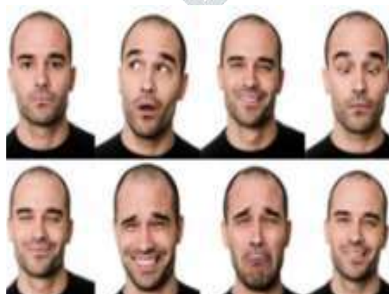
Figure 3.2 Facial Expression of a Person

Sometimes in face recognition, a prerecorded face pattern may not match with the current facial expression. This ambiguity is due to slight variation in the facial expression. Figure 3.2 represents some of the facial expressions from the database collected from the University of Minnesota.