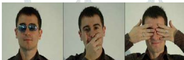
Figure 3.4 Simple Occluded Face Images

Viola Jones method uses Haar features to classify that detected objects is a face or not based on the difference in the intensity level of the different part of the face. The presence of another object in front of the face hinders the detection of the required feature to possibly detect a face. Hence more features with more data points are incorporated in the basic face detection method to increase the efficiency. Figure 3.4 shows some of the occlusions such as a sunglasses on the face, mouth covered and eyes covered. Apart from these factors hairs in front of the face or else an object in front of the face can also affect the face detection.