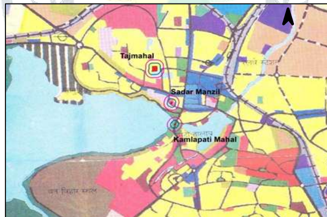
Figure 6. Land use map as per Bhopal Master Plan 2005

The plan mentions the inadequacy of the previous plan that it did not include heritage aspects. It was the successor of 1991 master plan. This plan also mentions conservation of heritage areas as one of its objectives but no further provisions were made to fulfill these objectives. The focus of the plan was mainly on infrastructure development and its improvement with no consideration of heritage by laws and provisions. There were no development regulations and heritage zones defined in the master plan around heritage sites.