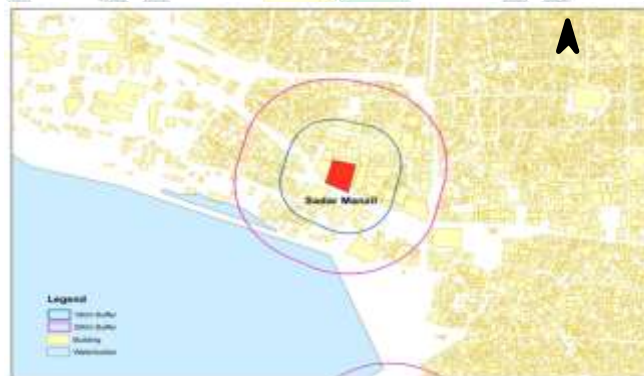
Figure 4. Built Structures around Sadar Manzil

Sadar Manzil has served as the office for Bhopal Municipal Corporation for quite a few years. Recently meetings were conducted between BMC and the Heritage cell and it was discussed to move the office from the site and develop Sadar Manzil as a Heritage site again. BMC office was moved to a new location in 2015 and all the activities going on the site were shut down. The site is currently being restored and will be preserved as a historic site under Smart City. The restoration is said to be a flagship project. The site after restoration will be preserved as a heritage site and the activities will be shifted to other locations.