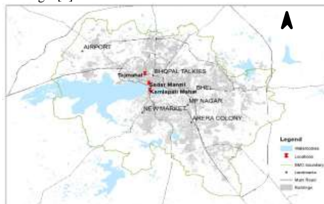
Figure 1. Location of the Selected Sites

Today, Bhopal remains a city of considerable beauty. The two lakes of Bhopal still dominate the city; bordered along their shores are the old city with its marketplaces, magnificent mosques and palaces, and the new city with its verdant, exquisitely laid out parks and gardens, broad avenues and streamlined modern buildings. [1]