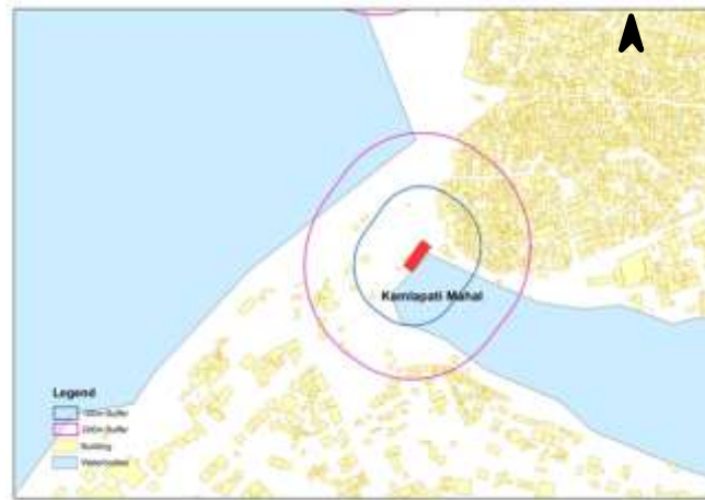
Figure 3. Built Structures around Kamlapati Mahal

monuments and archaeological sites and remains Act, 1958. The place is developed as a small recreational area rather than a place of national historic importance.