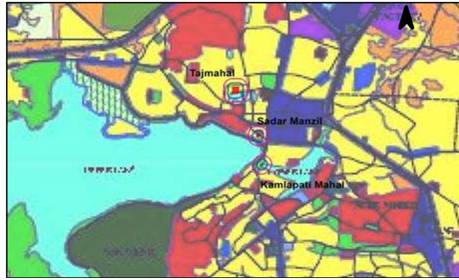
Figure 7. Land use map as per Bhopal Master Plan 2021