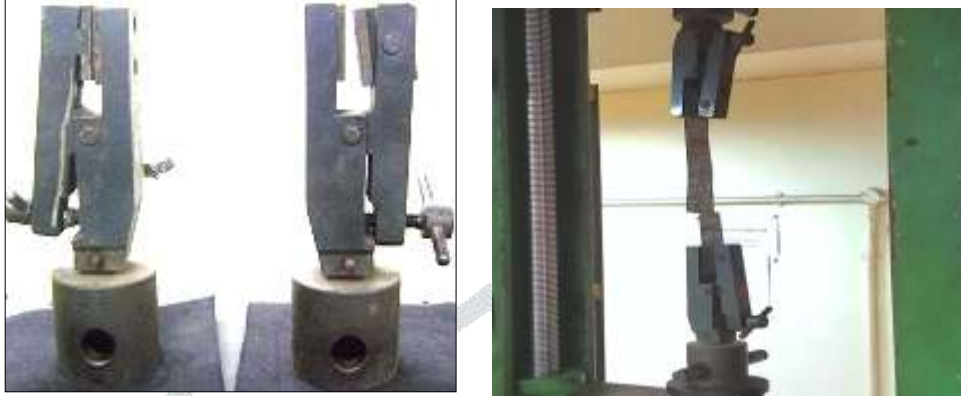
Fig. 2. Clamps and jaws faces and specimen during testing

In order to investigate the mechanical properties of FGP nonwoven paving mats, strip tensile test were conducted in the laboratory according to ASTM D 5035 and ASTM D 7239 method. In this test method breaking force and elongation of nonwoven fabrics is assessed using narrow cut strips of specimen of size 250 mm (length) x 50 mm (width) and gauge length of 180 mm between jaw faces as shown in Fig. 2. The jaw faces must be sufficiently wide to grip the entire width of the samples. Upper and lower jaws are assembled in the UTM as shown in Fig.1. Upper jaw is supported by a free swivel which allows the clamp to rotate in the plane of fabric. A test specimen is clamped in a UTM and longitudinal force is applied at a speed of 50 mm/min until the specimen breaks to determine the breaking force and elongation. Average of the breaking force and elongation is calculated for all acceptable specimens. The clamps and jaw faces with the specimen during the test is shown in Fig.2.