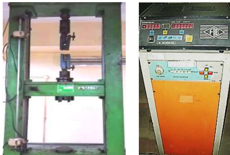
Fig. 1. Narrow strip jaws and fixtures assembled in UTM and a recording panel

Universal tensile testing machine (UTM) of FIE make of constant rate of extension (CRE) type and having accuracy \pm 1\% was used. The machine is equipped with recording and display panel and a printer. The machine is capable of providing constant test speed, recording force and displacement reading. It has facility of cross head which can move in upward and downward direction as per the requirement of test. This machine can be assembled with various jaws and fixtures to perform test like wide width tensile strength, trapezoidal tear, static CBR Puncture test etc. at a specified rate of extension. Figure 1 shows narrow strip jaws and fixtures assembled in UTM and a recording panel.