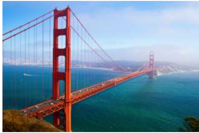
Fig: 2.1.1. A Typical Suspension Bridge

are typically concerned to evaluate optimum post-tensioning forces in the dead load configuration, without achieving the complete optimization of the geometry, the stiffness of the structural elements and thus cost of construction [2].