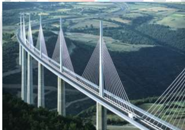
Fig: 2.2.1. Cable Stayed Bridge

The requirement of incredible long span bridges is increased day by day with increase in inhabitants and their needs. To achieve a very long span bridge, use of high strength material along with novel structural system is essential. To achieve longer span bridges and good structural system the cable stayed bridges are used, in which the cable-stayed bridge has better structural stiffness than suspension bridges.