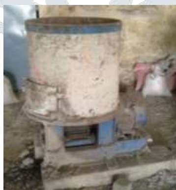
Figure 2 Pan Mixer