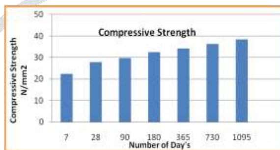
Figure 8 Compressive Strength in GPC in Different Days

Geopolymer concrete of nominal mix ratio of 1:1.5:3.0 (M 20) is used with alkaline solution and the compressive strength of concrete is obtained. The density of geopolymer concrete is found as 2350 kg/m 3 which is less to that of cement concrete. The 7 days and 28 days average compressive strength of geopolymer concrete cubes gives 22.37 N/mm 2 and 27.85 N/mm 2 respectively. The average compressive strength of geopolymer concrete cubes at 90, 180, 365, 730 and 1095 days obtained as 29.70, 32.40, 34.25, 36.20 and 38.37 N/mm 2 respectively. The rate of increase in strength is found to be 23%, 31%, and 40%, at 1, 2 and 3 years with respect to 28 days compressive strength. These results obtained in geopolymer concrete are suited for structural applications with a minimum concrete strength of 20 MPa.