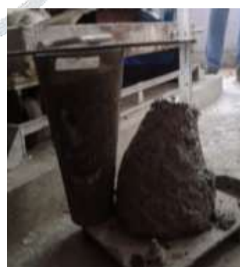
Figure 3 Slump Test