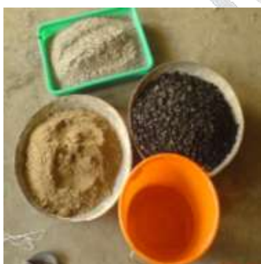
Figure 1 Materials for GPC

After casting the specimens (Figure 4), they are kept for 1 day in rest period at room temperature. The term 'Rest Period' is coined to indicate the time taken from the completion of casting of test specimen to the start of curing at an elevated temperature. After casting, the specimens are covered using vacuum bagging film. A steam boiler is used to generate the steam, (Kumaravel et al., 2013) at a specified temperature of 60° C (Figure 5). The curing at 60° C was done in the steam convert by the channel in steam curing chamber for 24 hours (Figure 6). The geopolymerconcrete is de-moulded and then placed in an autoclave for steam curing in 24 hours at a temperature of 60°C.