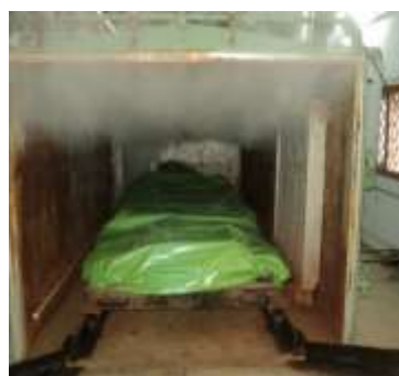
Figure 4 Casting of Specimens