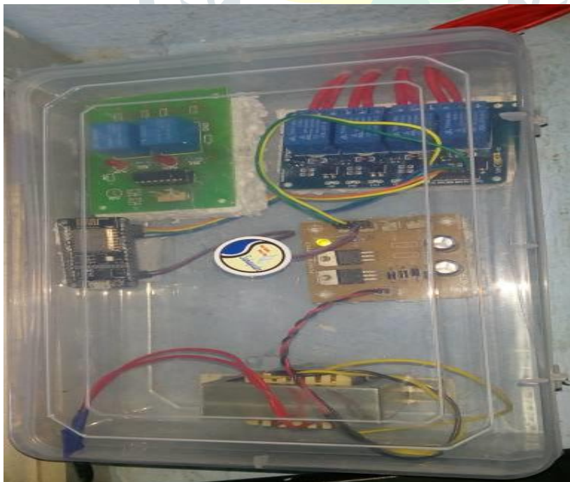
Fig. HOME AUTOMATION USING A SMART PHONE & BLYNK APP