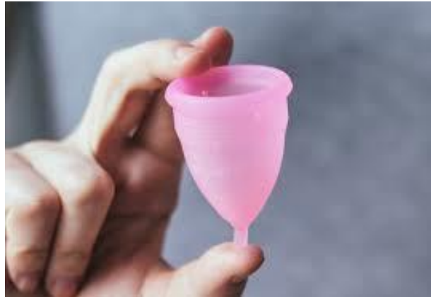
Menstrual cup

(First Menstrual cup advertisement)