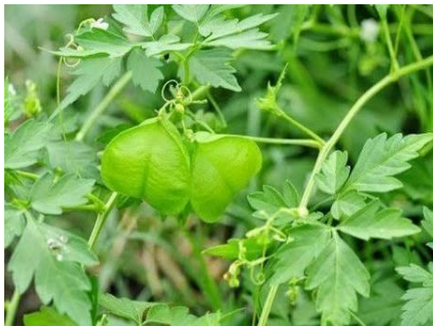
Fig: 1 Cardiospermum halicababum