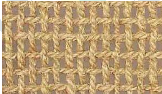
Figure 3: woven geotextile

Coir is a natural product made from coconut fiber. The most common uses for coir are sediment control and soil bio-engineering. Because coir is 100% natural, it is also biodegradable. They support growth and development of vegetation and can be made and used for short term, temporary, or semi-permanent applications.