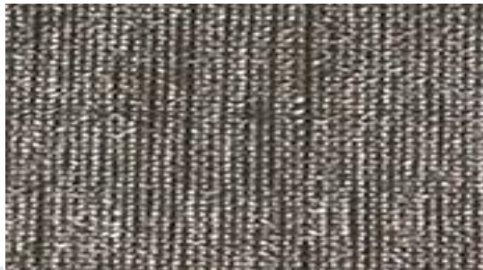
Figure 2: woven geotextile

Our woven geotextiles are also made from polypropylene, but in slit film or monofilament form. Slit Film is a thin/wide sheet of plastic and Monofilament is oval/round shaped yarn. Both materials are extruded, slit, stretched to align molecular chains, and finally put on a loom to be woven. This geotextile fabric is best used for road construction, with rip rap, heavy erosion, embankments, and steep slopes.