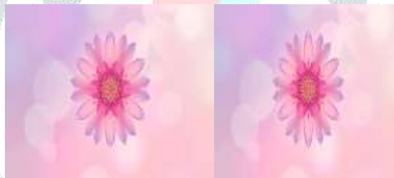
11 Original Pink Flower 12 Stego Pink Flower Image