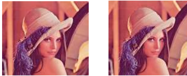
Fig 3 Original Lena Image Fig 4 Stego Lena Image