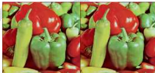
7 Original Peppers Image 8 Stego Peppers Image