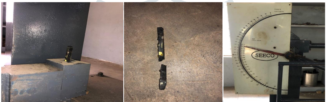
Fig-4.2 Izod Impact Test showing before and after testing

Izod impact test is an ASTM standard method of determining the impact resistance of materials. In this test the notched specimen of size 64X9X9 mm is used to determine the impact energy.