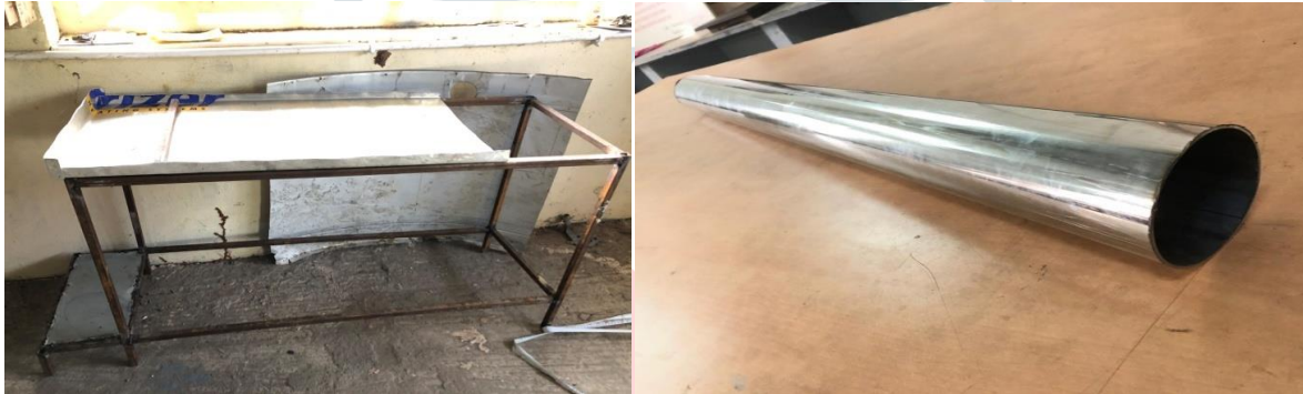
Fig-3.4.1 Frame and Stainless steel pipe

Length = 4 feet Diameter = 4 inches Thickness = 4 mm