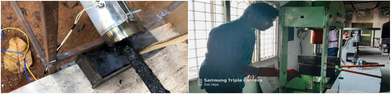
Fig-3.5.1 Loading Molten Plastic into the Mould and Applying Hydraulic load

After the molten plastic is poured into the mould Hydraulic load is applied on the compression plate which is placed on the top of the mould. By giving the hydraulic load it increases the strength of the Brick and removes the air gaps inside the mould. After 5-10 minutes the load is removed by unloading and the mould is left to cool in the atmospheric air. Once the mould gets cooled remove the Plastic Brick from the mould and check the object.