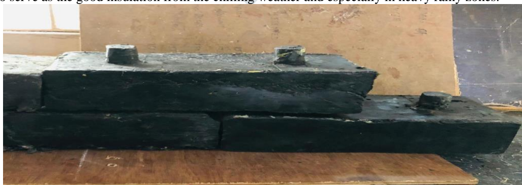
Fig- 5.1 Final Construction

Some people have doubts whether it is ok to construct the houses or walls by using the Plastic Bricks, is it safe or can have long life. Here my answer, in one's life time one might produce the enough plastic waste which is sufficient to construct the compound walls and plastic blocks in the garden. If someone produces it beyond that amount, we can even construct small houses or can be used to construct walls for the home. It contributes to minimize the environmental pollution in cities, villages, seas, lake and rivers. They also serve as the good insulation from the chilling weather and especially in heavy rainy zones.