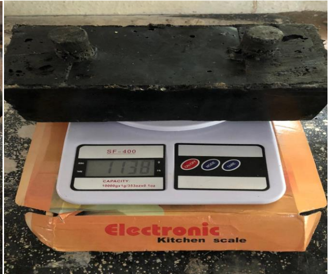
Fig-4.3.2 (b) After Soaking

Inference: From the above test comparisons we can say that these bricks are very bad for water absorption. So they can be used in cold weather countries or use as Paver blocks etc.