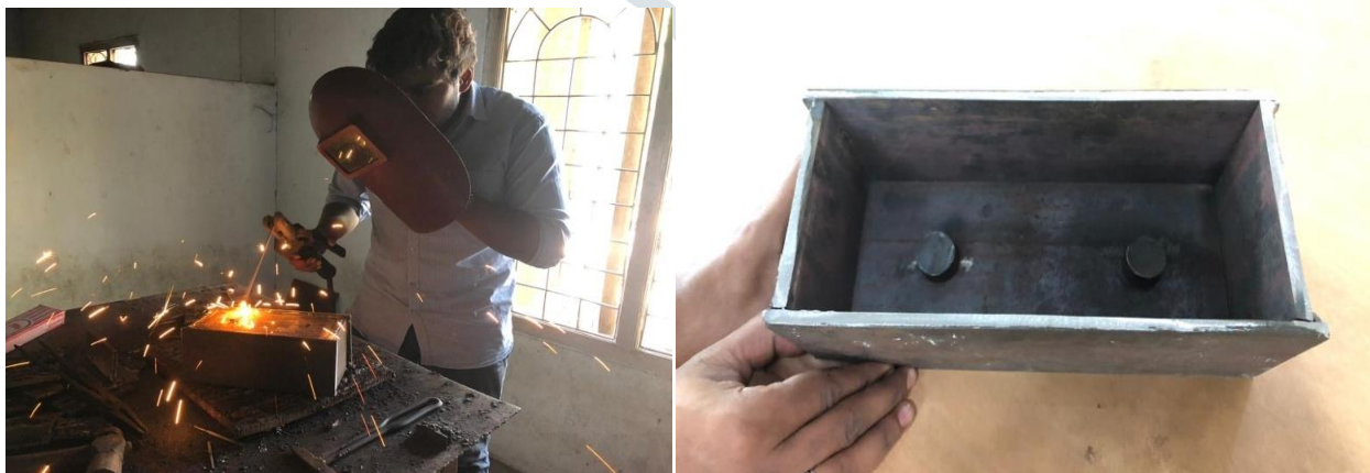
Fig-3.3.1 Fabrication of Mould