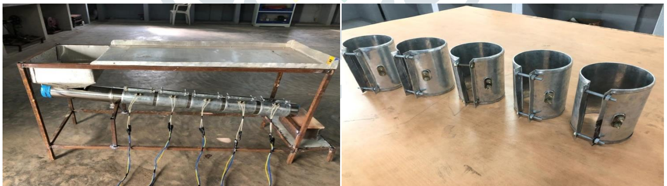
Fig-3.4.2 Equipment and Heating coils

For melting the plastic pieces which are placed inside the steel pipe we need an external source of heating device. By considering the amount of plastic to be melted and length of the steel pipe, certain number of coils is required. And these coils are mounted around the steel pipe. The heating element which is used inside the coils is Nichrome wire.