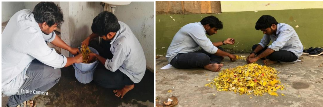
Fig-3.2: cleaning the shredded plastic

Plastic which are collected from the scrap facilities is very dirty and it requires cleaning before recycling it. The shredded plastic pieces are cleaned by water and properly filtered. After it is washed it is required to dry before being melted.