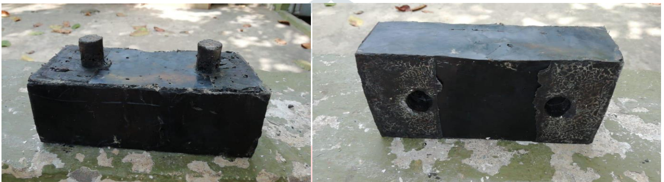
Fig-3.5.2 Final Brick of size 22X9.5X6 cm

The mould should be cooled in the atmospheric air for better properties and structure of the Brick. If the mould is quenched directly in the liquid it may change the properties of Brick and makes it brittle.