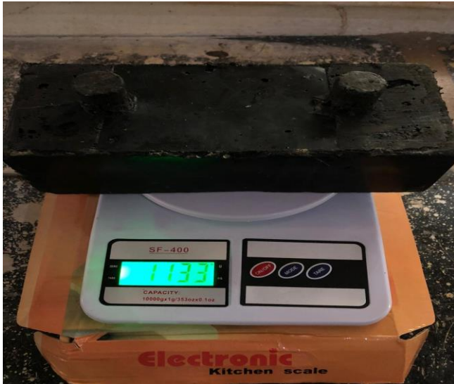
Fig-4.3.1 (a) Before Soaking