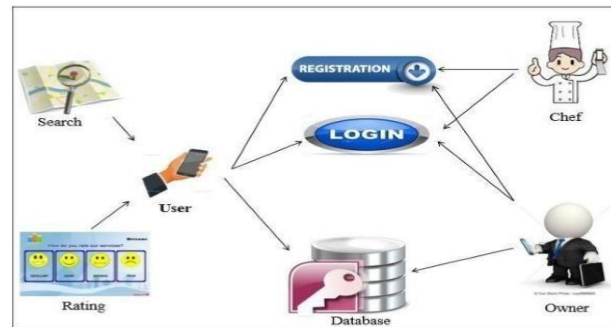
Fig.1: System Architecture

The figure.1 represents the simple system architecture of the proposed system: -