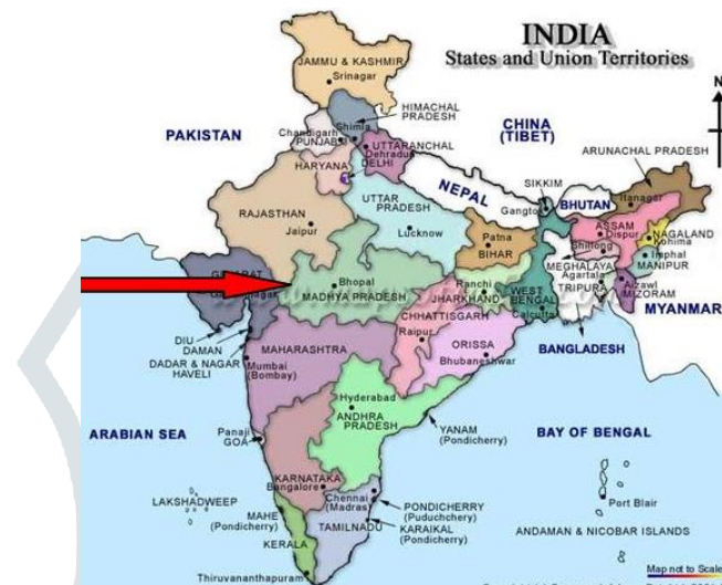
Fig. 1 Location of study area

In the present study the AOD data are retrieved from the Ozone Mapping Instrument (OMI) at 354nm/388nm of UV region, also known as AAI (Absorbing Aerosol Index). AAI data obtained from OMI are in the gridded form of resolution 1^{\circ} \times 1.25^{\circ} latitude-longitude. The rain fall or precipitation data is retrieved from the website of Government of Rajasthan (India). In the present paper we have taken Banswara (23.11°N, 74.375°E), India as our study area, which belongs to the southern part of Rajasthan. The tropic of cancer also passes through this region. The climate of Banswara region is extremely hot and exhausting during summer, temperature ranges from 30°C to 46°C in the months of March to June. The Mahi river flows here. The average annual rainfall in district is 950.3mm and humidity percentage is 57. Here mining is done in large amount. Here in Fig. 1, the study area is indicated by red arrow.