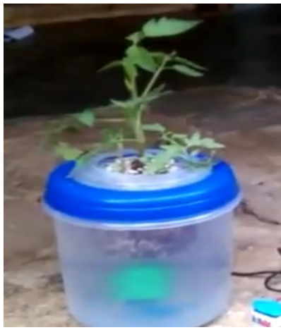
FIGURE 2: Tomoto plants growing in soilless culture machine

The tomato plants growing quickly by using only 4litre water and it take only 1gram of nutrients and it grows very healthy on that medium on thermacol and the roots were freely grown.