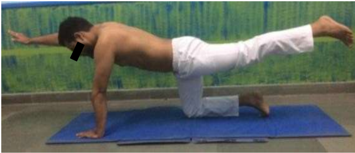
Figure-2 Bent knee position