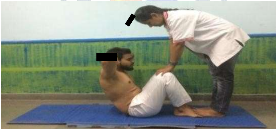
Figure 1-Bent knee position

Prior to applying the electrodes, the skin was cleaned with alcohol swab to reduce skin impedance and shaved if necessary. Electrode was placed along the longitudinal axis of Transverse abdominis (along the line joining ASIS to pubic symphysis).