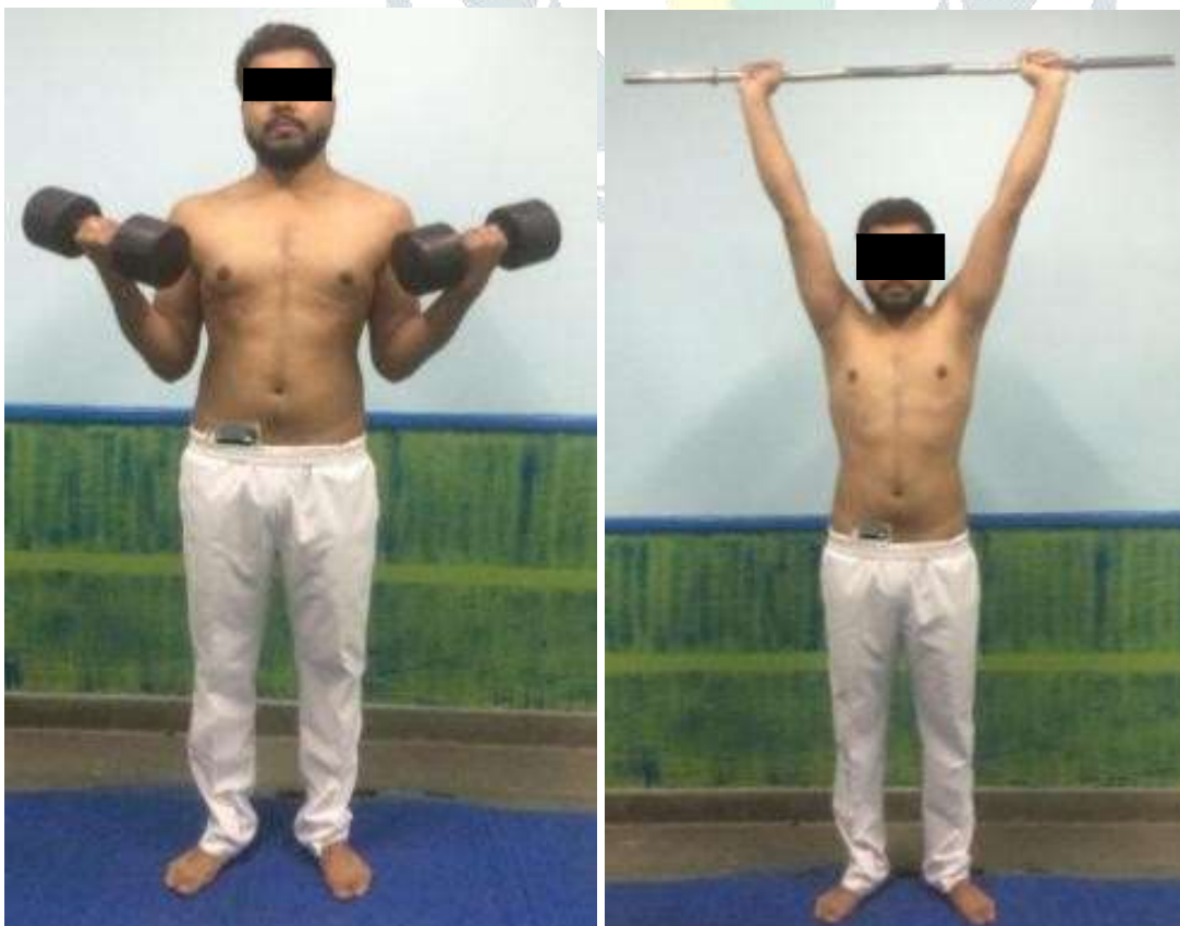
Figure -4 Non Core exercises.