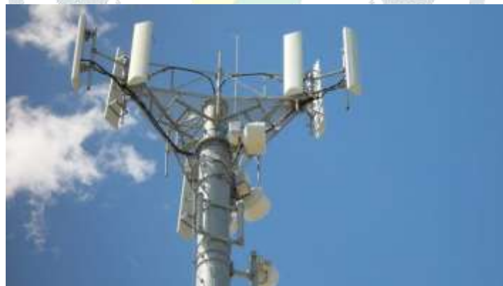
Figure 1: Antenna Array under LTE Network

In numerous remote correspondence frameworks it is important to structure antennas with order qualities (high gains) to fulfill the needs of long separation correspondence that may not be attainable by a solitary component antenna. The radiation from the single component is frequently wide in design with huge shaft edges. This isn't useful for point to point interchanges, which requires antennas that are increasingly mandate in nature for example Radar applications. Likewise, a solitary emanating component regularly creates radiation designs with unsuitable bandwidth, effectiveness, and gain parameters. All these and more make the use of a solitary component antenna not recommendable. In this manner, the execution of antennas in array design defeats these downsides.