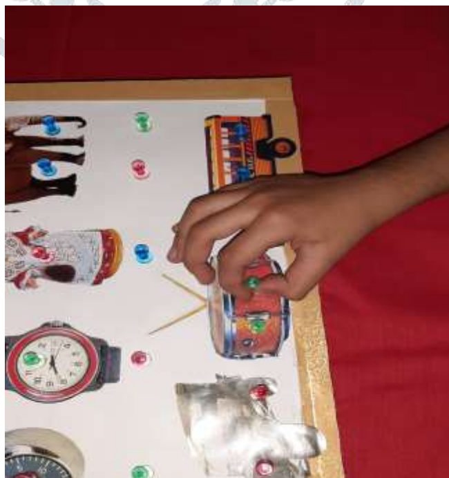
Fig. 3 patient trying to remove pegs post application of KT.