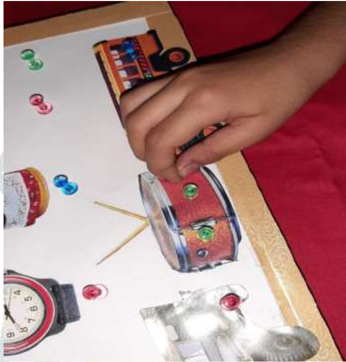
Fig. 2 patient trying to remove the pegs pre application of KT.