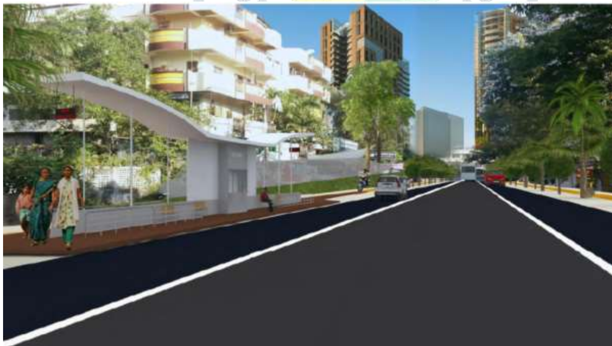
Road development at pachmiri near RDVV UNI.