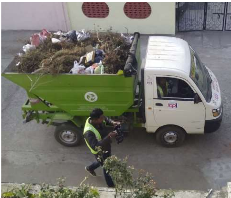
Collection of Garbage from Door to Door Services by Nagar Nigam.