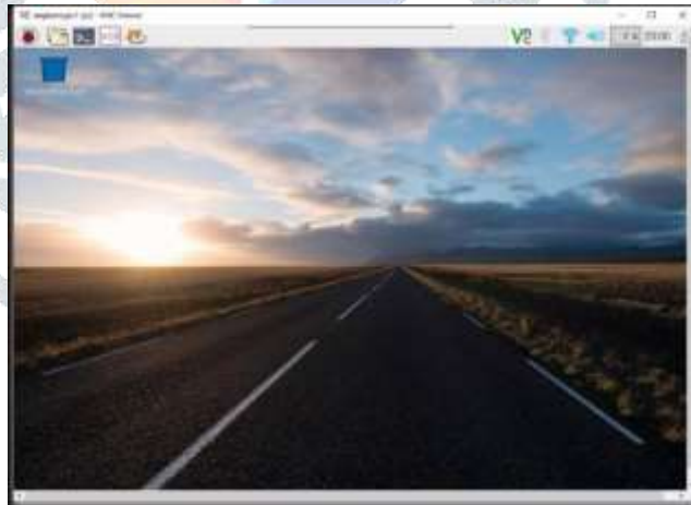
Fig4: The Raspberry Pi desktop