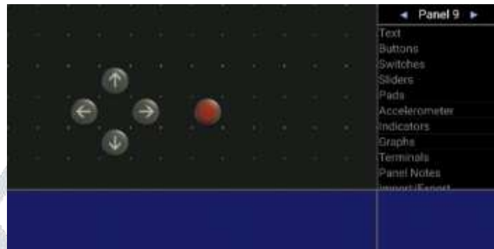
Fig 6: Configuring the buttons