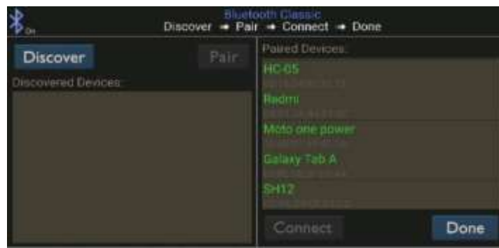
Fig 5: Pairing with Bluetooth module