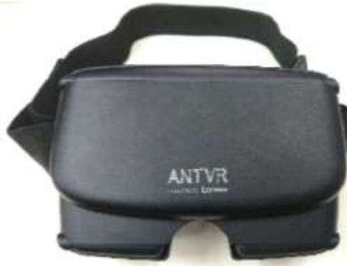
Fig 3: VR headset