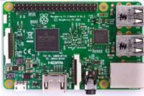
Fig 2. Raspberry Pi model B