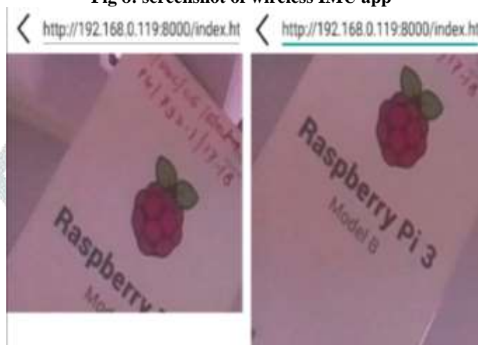
Fig 9: screenshot of dual screen app