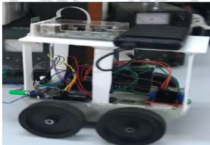
Fig 7: Telepresence surveillance robot

After the proper assembly of hardware and installing followed by running the required software we demonstrated that the telepresence surveillance robot can provide HD coloured live video in a region and direction as per our requirement.