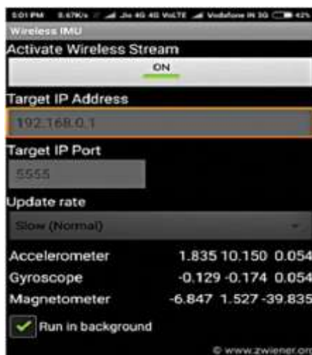
Fig 8: screenshot of wireless IMU app