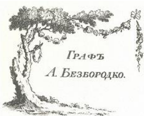
книжный знак канцлера, светлейшего князя Александра Андреевича Безбородко