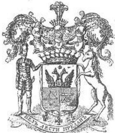
EL графа А.А.Аракчеева