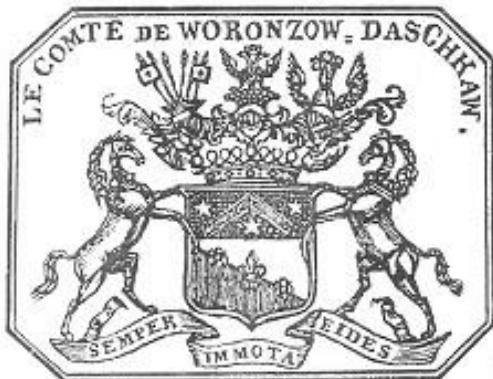
EL графа И.И.Воронцова-Дашкова