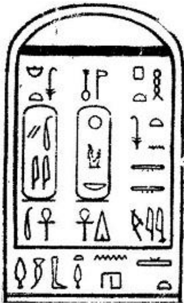
книжный знак фараона Аменофиса III (ок. 1400 год до н.э)