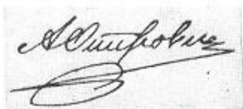
EL драматурга А.Н.Островского

БИБЛИОТЕКА Николая ПЕТРОВИЧА СЫРЕЙЦКОВА.