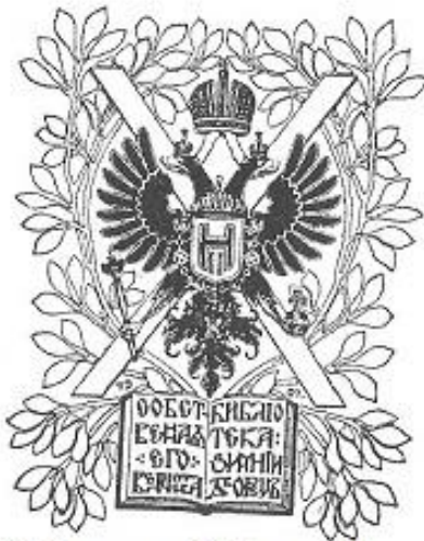
А.Е.Фелькерзам EL Николая II