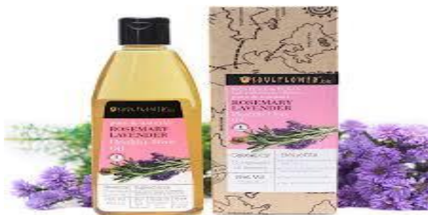
Fig: 6 Lavender for hair

Lavender is one of the most well-known herbs for promoting hair growth and reducing balding. Lavandula angustifolia oil has anti-inflammatory, anti-microbial, and antiseptic properties. Lavender oil improves scalp circulation, strengthens new hair growth, and helps to regulate the scalp’s natural oil production. Lavender oil is also a natural insect repellent, making it effective against disease carrying parasites such as fleas, ticks, mosquitoes, and head lice.