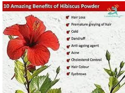
Fig: 7 Hibiscus for hair growth

Hibiscus is packed full of antioxidants and vitamins that help to improve the overall health of the scalp and hair. It is also a very effective treatment for dandruff which can interfere with healthy hair growth.