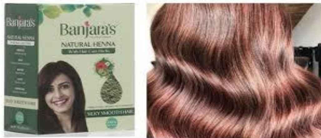
Fig: 9 Banjaras Herbal Henna

Her stylist had acquired a formaldehyde-containing hair treatment in Morocco. The patch Test revealed that formaldehyde and non-formaldehyde components were presents. The dried and powdered leaf of Lawson inermis is used to make red henna. Henna has long been used as skin, Hair, and nail color. There have been few cases of allergic contact dermatitis due to the use of Red henna and its active component Lawson.