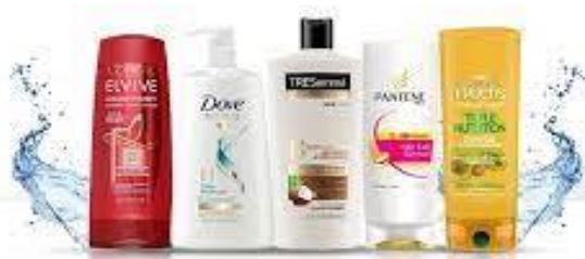
Fig: 11 Marketed hair Conditioners