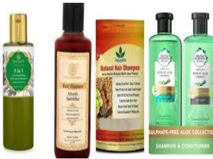
Fig: 10 Marketed Herbal shampoos