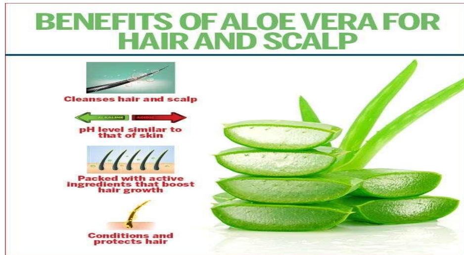
Fig: 5 Aloe Vera for hair

The use of Aloe Vera gel on a regular basis will aid in the maintenance of the hair’s pH balance. It will also aid in the opening of blocked scalp pores and the stimulation of hair follicle development.