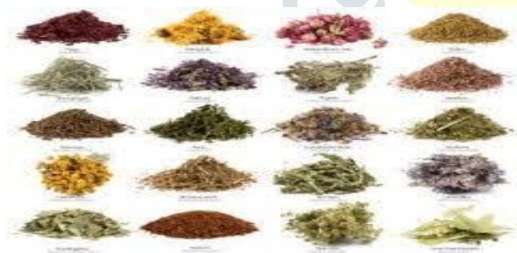
Fig: 8 Ayurveda herbs

Below figure 8 represent the herbs used for hair growth.