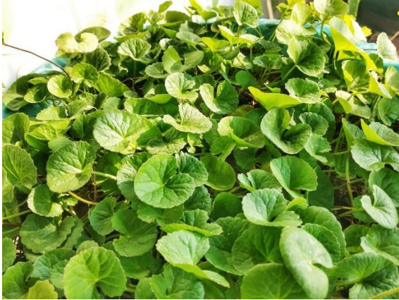
Fig: 2 Brahmi

Brahmi is used in Ayurveda for nourishment and to prevent hair loss. Head massaging using Brahmi oil increases blood circulation in the scalp and makes the roots of the hair stronger. Brahmi oil is used to treat dry, flaky scalp and dandruff. Brahmi used as a powder in a mask or oil can reduce pre-mature greying, hair-loss, promotes hair density, shine and treats scalp treatments.