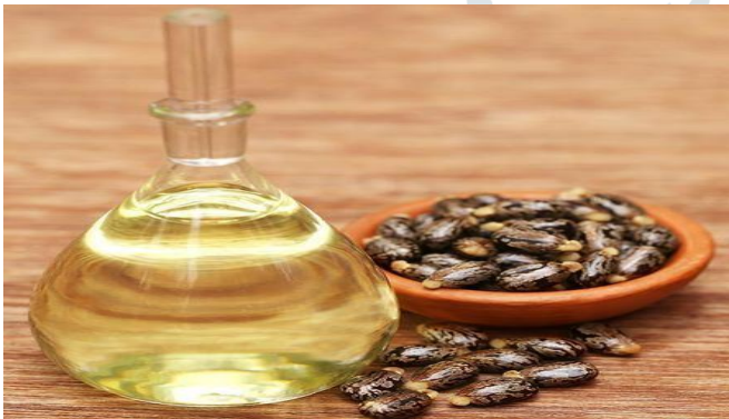
Fig: 3 Castor oil

Castor oil is an old remedy to prevent hair loss or assist with hair regrowth. This is because castor oil has the ability to improve circulation and increase blood flow. It contains anti-inflammatory and anti-microbial properties. The anti-fungal properties in castor oil are Ricin and Resinoleic acid which nourishes the hair. Castor oil is one of the few natural ingredients that stimulates hair growth, combats split ends, moisturizes hair and scalp, adds luster and shine, prevent frequent hair fall or breakage, thickness hair, makes it grow longer fast and fights against dryness and dandruff. Unrefined and extra virgin castor oil is best for hair health.