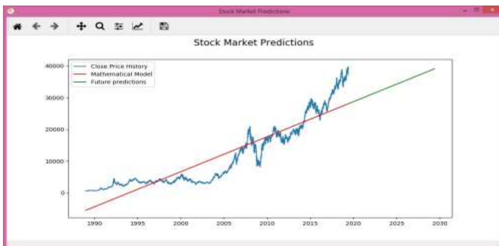
Figure2. Stock market Prediction

The subsection below discusses each stock index's experimental findings. Results of the ARIMA Model for Predicting Nokia Stock Price Table 3 displays the outcomes of the ARIMA (2, 1, 0) projected values, which is thought to be the best model for the Nokia stock index. Figure 2 shows graphically how well the chosen ARIMA model performed when comparing the forecasted price to the actual stock price. It is clear from the graph that the performance is acceptable. SAMPLE OF EMPIRICAL ARIMA (2,1,0) RESULTS FOR THE NOKIA STOCK INDEX is presented in TABLE III. Periodic Sample Actual Values Estimated Values.