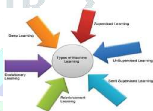
Fig. 1. Categories of ML technique.

There are several categories of techniques used for ML that are shown in Figure 1. The styles of machine learning methods are supervised, unsupervised, semi-supervised, reinforcement, evolutionary learning and deep learning. To identify the data collection, these techniques are used.