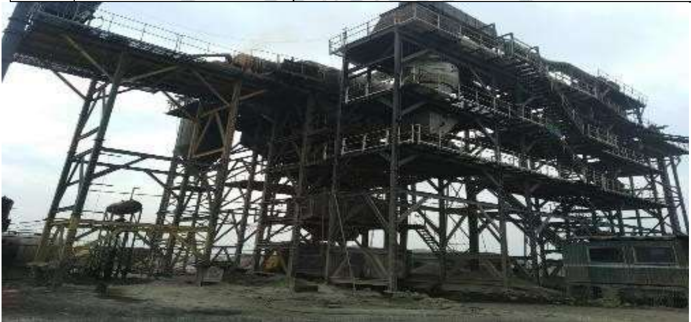
Fig-1: Picture gives prediction of the cold in plant recycling of reclaimed asphalt pavement (RAP).