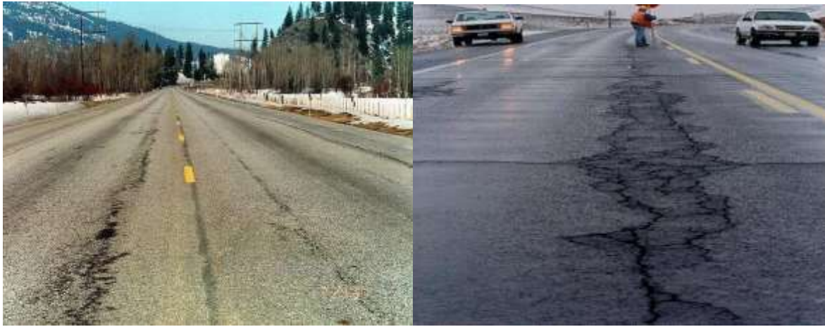
(a) Raveled road