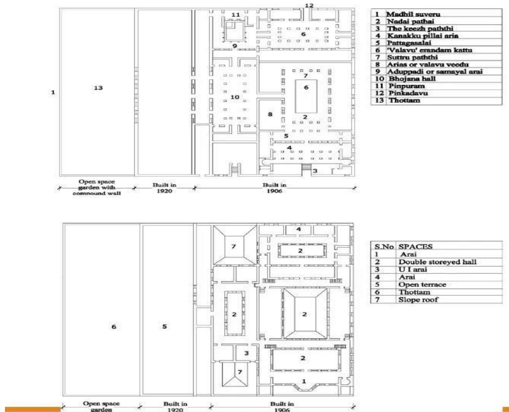
Image 4.1.1 before restoration plan