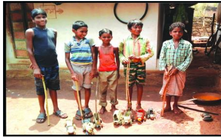
Fig 1: An example of a toy car with a precise chassis made by tribal children in Mandla

For a good engineer, we define cultural capital to be the ability to think creatively and innovatively, strong Mathematical and problem-solving skills. For the tribal communities, this cultural capital exists though it needs to be upgraded. In the subsequent paragraphs, we will demonstrate instances of this, as we have observed in our study of the tribal community here.