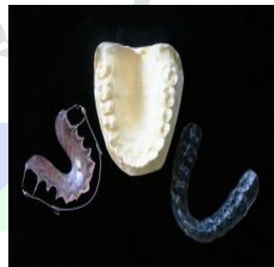
Fig1: Bite mark analysis

Forensic dentists are responsible for six main areas of practice [4]: