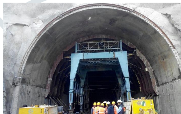
Construction Stages of Tunnel