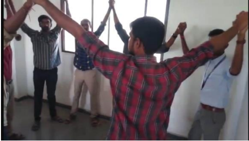
Figure 1: Holding Hands with Each other