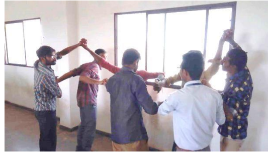
Figure 2: Trying to resolve the knot