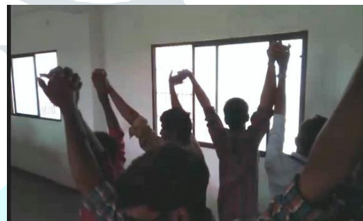
Figure 4: Completion of human knot

The activity of human knot is the best exercise to cultivate the students to understand team skills and strengthen the team to fetch the good result. Introducing this project to the technical students in A.P is the challenging prospect for British Council, conducting and implementing this project in Engineering Colleges is herculean task for trainer.