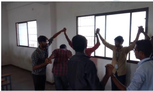
Figure 3: Bending, twisting, moving and untangling the knot