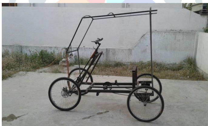
Fig-3. Final Stage of Physical Prototype