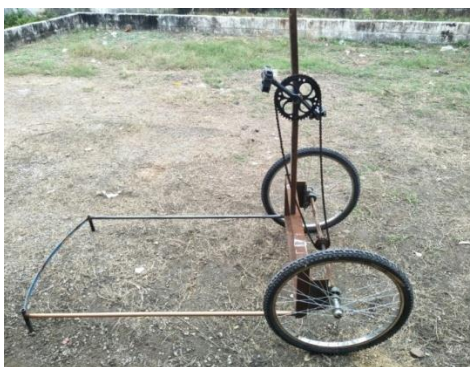
Fig-2. Physical model of the cycle