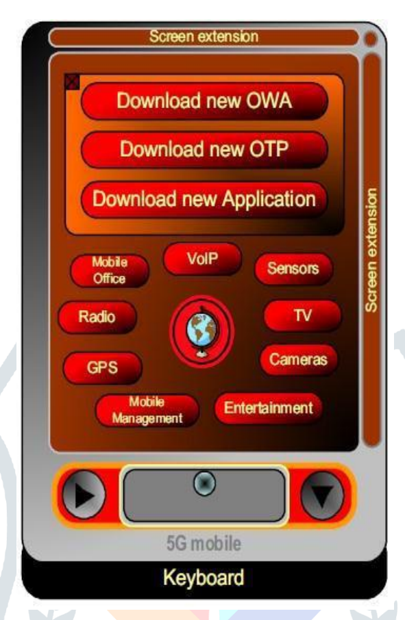
Figure 3: Design of 5G mobile phone [14]

5G cell phone outline is indicated in fig.3 [12]. To oblige the QoS and rate prerequisites set 5G is being produced through expected applications like, MMS, remote broadband access, video chatting, HDTV content, mobile TV, Digital Video Broadcasting (DVB),[18] nominal services like data and voice, and different services that employ data transfer capacity. The significance of 5G is to give satisfactory RF scope, further bits/Hz and to intersect the entire remote homogeneous systems to offer reliable, steady telecom skill to the customer [10, 11].