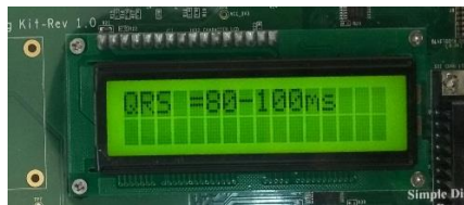
Fig5. Output in CLCD