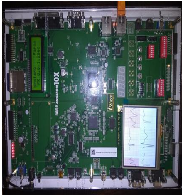
Fig6. Output in UTLP Kit