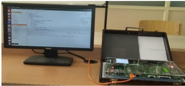
Fig1: PC and Client interface