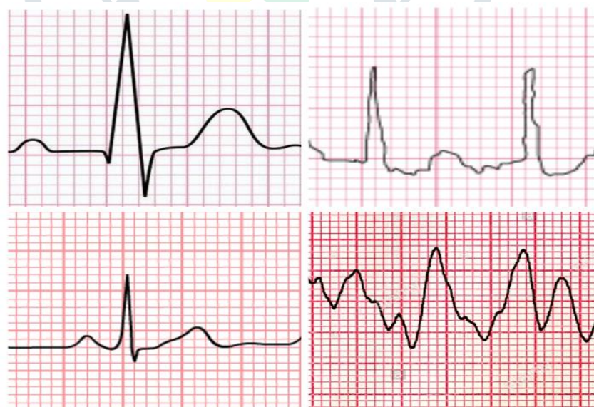
Fig4. ECG waveforms

The console window used to give the input of different parameters via keyboard. The given input data is compared with program and display the condition of the heart. Ex: BP is normal or abnormal, such as for pulse rate and body temperature. The final result of the health monitoring system using UTLP kit is shown in the CLCD and console window. The console window used compare the given parameters data with data given in program. The condition of the heart is displayed in the CLCD and console window.