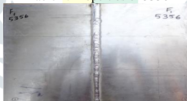
Fig. 2 Weld using 5356