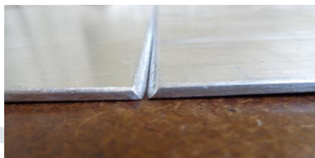
Fig. 1 Edge Preparation

The work piece is cut into required dimensions and the edge preparation is done using an angle cutter on a CNC milling machine.