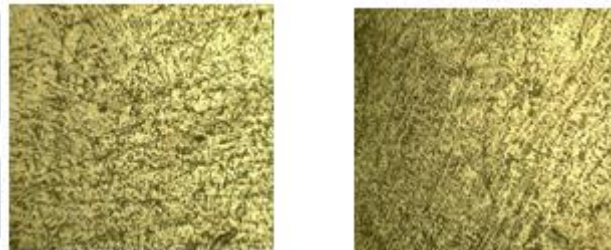
Fig: 5 Microstructure of Aluminum Alloy (6351) at Fusion Zone (FZ) for Filler wires 5356 &amp; 4043