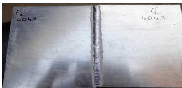
Fig. 3 Weld using 4043