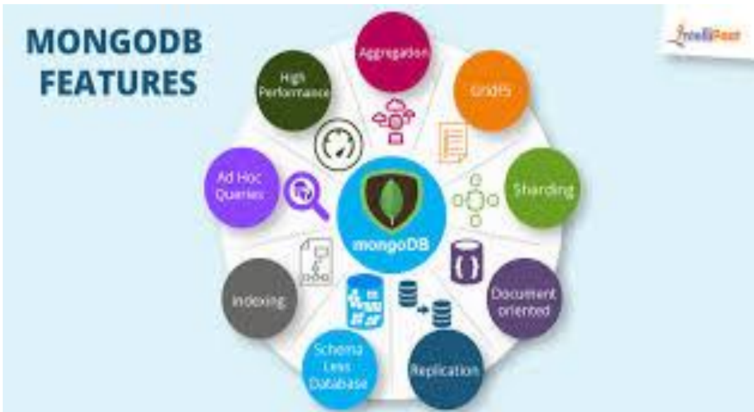
Fig 1 : features of Mongo db