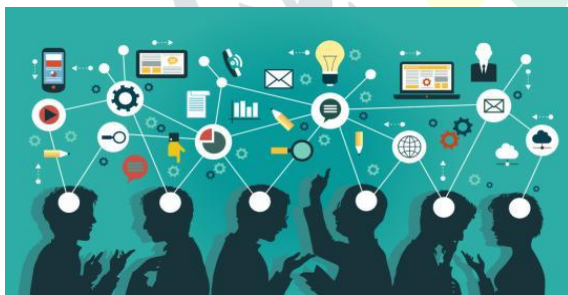
Fig. 1: Crowd sourcing

Crowd sourcing actually works on web 2.0 phenomenon which includes using social media and networking sites. Now-a-days many people are working in the social media than working in outside world, so we can get lots of data if we use this phenomenon. Even, Google started collecting data all over the world with an app called crowd source.