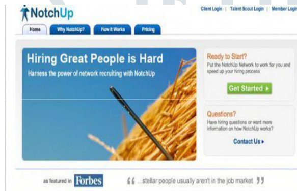
Fig. 3: Notch Up app

Many professionals have an existence on Facebook, LinkedIn, or in Twitter. While an individual employer may only be able to search into a few of those profiles, crowd sourcing can help this entire web for information. Notch Up helps companies hire executives by crowd sourcing information through online networks.