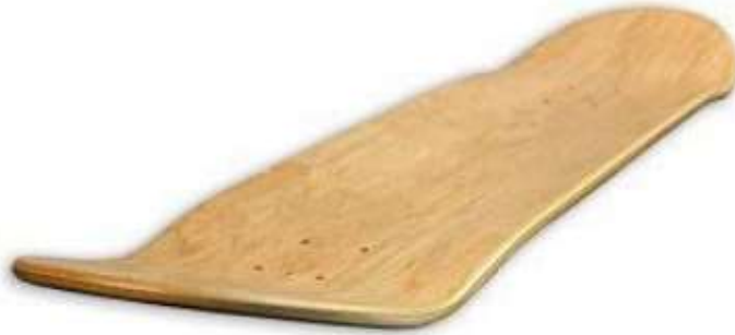
Fig 5: wooden board