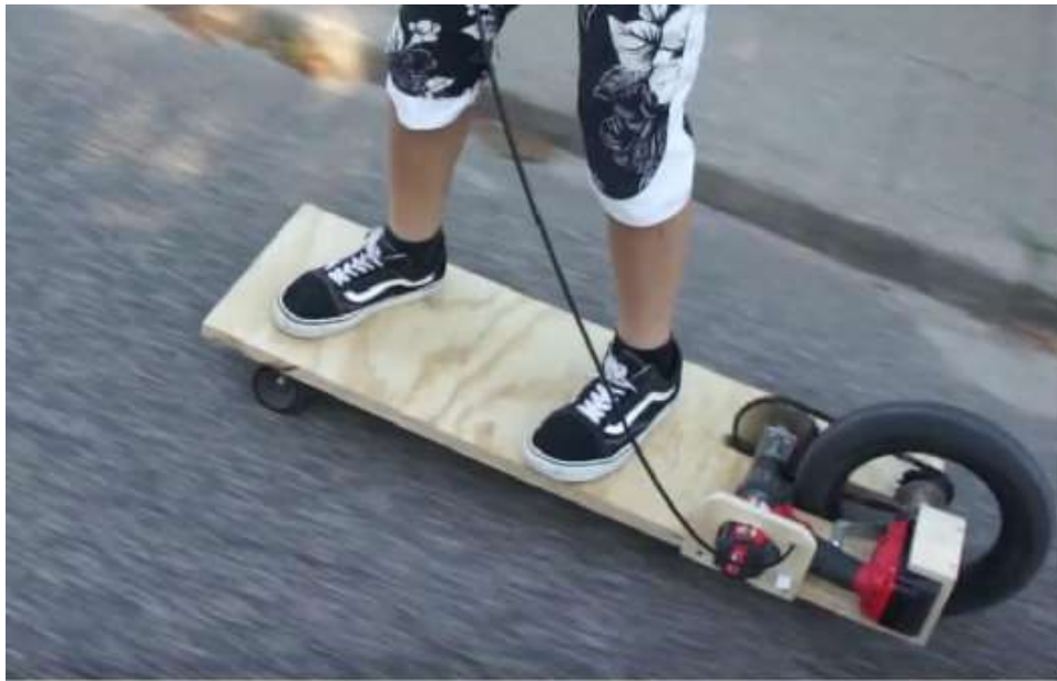
Fig 1: Electric longboard