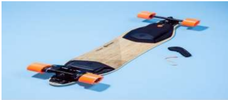
Fig 2: Electric skateboard