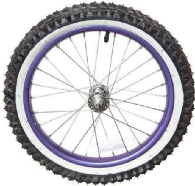
Fig 3: Rear-wheel