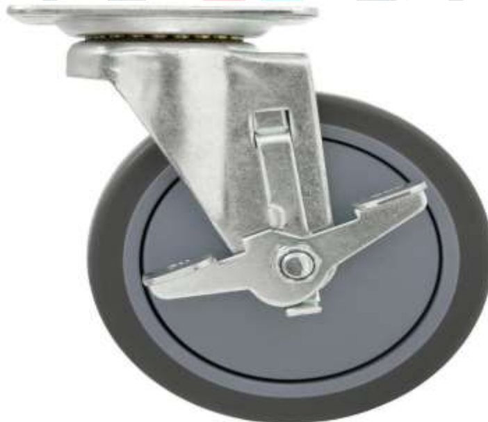
Fig 4. Front-wheel (caster wheel)

On the front side, we use the trucks that connect the smaller wheel of the diameter of 4 inches. We use the smaller diameter of wheels in front because smaller wheels have less inertia to overcome to get spinning, in the rear side we used bigger wheels as compared to normal skateboard because when we are in bigger wheels it can roll much faster over the rough surface. Smaller wheels are more maneuverable.