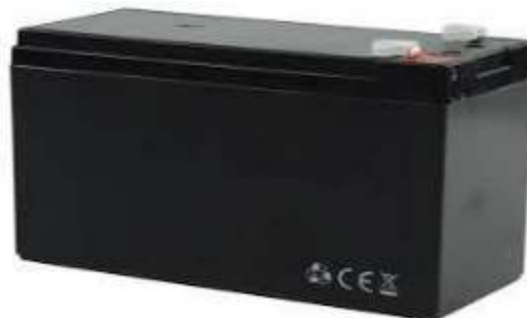
Fig 7: Battery

The authors used a 24-volt single battery for providing power the motor that generates power and the sprocket transmit it to the wheel. Earlier the battery used in electric longboard was the dead lead-acid battery which was heavy less power as improving the technology they use a lithium-ion battery which lightweight more power. Two battery of 12v each and 13 ampere/hr.