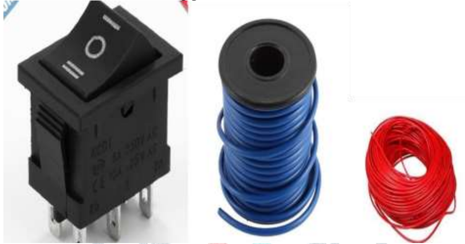
Fig 8. Push-button, wire cover and wire

The body of the switch is made of non-conducting plastic.