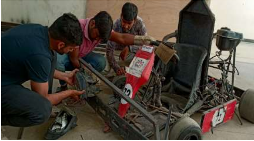
Figure 5. Lights getting fit on the holder

Connecting links are the linkages that connect the offset of the steering wheel to the offset location of the headlamps. These are also made up of Mild Steel and were 450mm in length. We had connected them to the offset provide in the steering wheel and then this was further connected to the headlamps to translate the push or pull action. Since the headlamps are affixed on a pivot they tend to rotate on the free and loose axis.