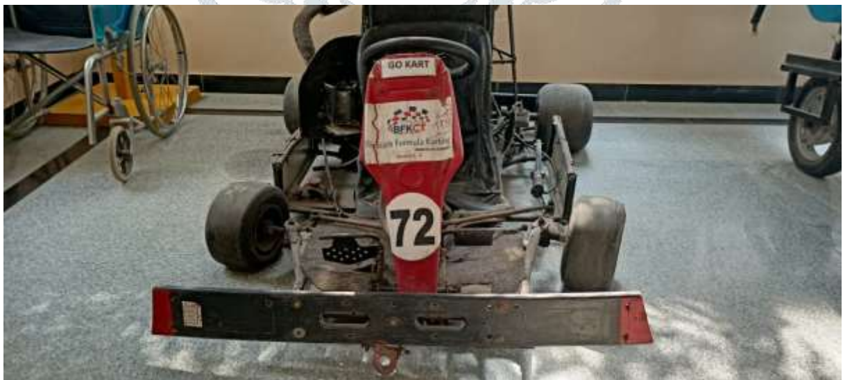
Figure 3. Go Kart Model

Rather than building the entire frame and chassis of the vehicle to embed the headlamp assembly. The GO Kart that was used by the racing team of Reva University was utilized to demonstrate how this mechanism and the steering wheel system works. We first analyzed the steering assembly that was already present in the go kart fabricated by Reva University.