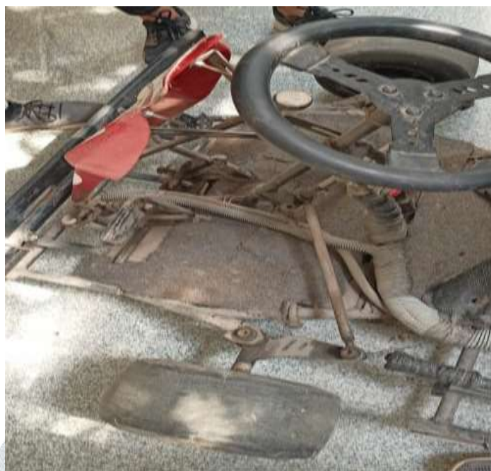
Figure 4. Steering Assembly of Go Kart

purposes, which not only gave it a limited angle of tilt but also if anything was attached to the steering wheel it would obstruct the body. The steering mechanism is shown in the image below for the reference.